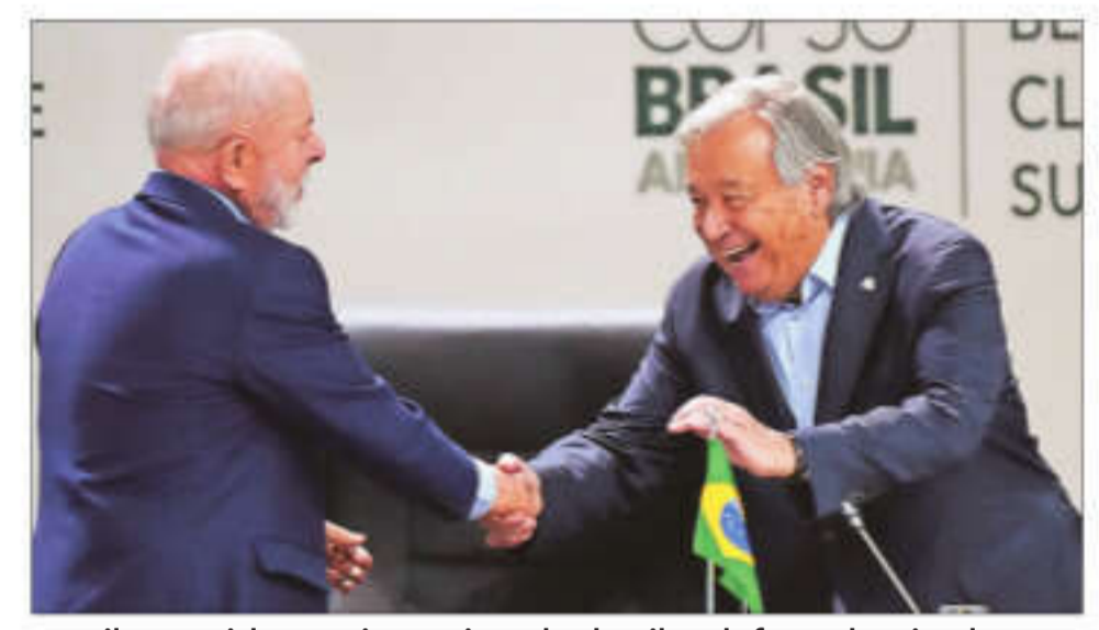
Brazil's President Luiz Inacio Lula da Silva, left, and United Nations Secretary-General Antonio Guterres shake hands at COP30 UN Climate Summit in Belém, Brazil, on Thursday

WORLD LEADERS ARE set to deliver a message of solidarity and renewed resolve to address global warming days before the start of the COP30 climate summit in Brazil, despite lackluster attendance and the erosion of a key goal to curb rising temperatures. It's a challenging backdrop for the more than 50 heads of state and government ministers expected in the Amazonian city of Belém on Thursday and Friday. Gone is the confidence and sense of grand ambition that united nearly 200 nations a decade ago, with the adoption of the landmark Paris Agreement. Left in its place is a gnawing sense of urgency and the hard reality of implementing some climate promises, especially as the accord's most ambitious goal—to keep warming to 1.5C above pre-industrial levels—moves further out of grasp. The leaders summit is only a prelude to the official negotiations that